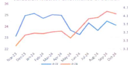
Valuation Matrix Performance of Sensex